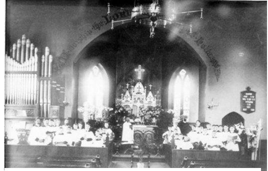
Note gas fixtures.